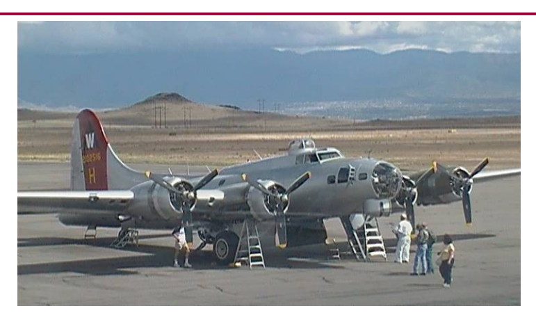
B-17, Aluminum Overcast, at KAEG. See page 6...

Chapter 179 meetings are on the third Tuesday each month, except in December when it is replaced by our Christmas Party.