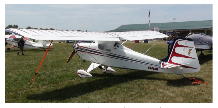
This pretty Pober Pixie blew my skirt up. It has a 100 hp 0-200 engine and is strengthened.