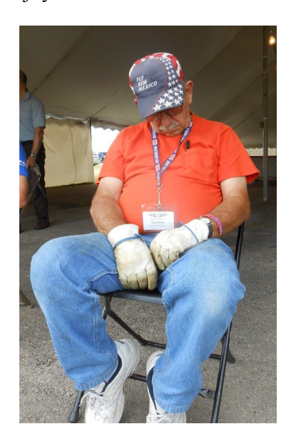
Even the mighty have to rest after all the hard work and the HEAT!