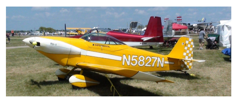
The first of the family of RVs, this RV 1 was donated to the EAA Museum at AirVenture 2012