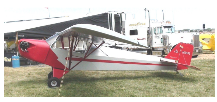
This Piper-Taylor E2 Cub was the only Cub that could claim a 75th birthday!