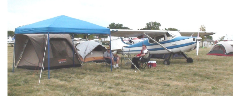
Camp Wadsworth. My new tent worked great!