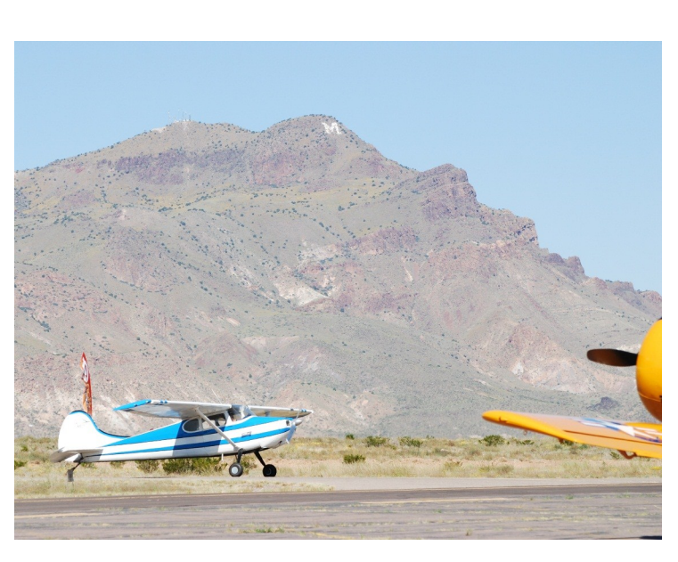
NM Centennial Air Tour at Socorro