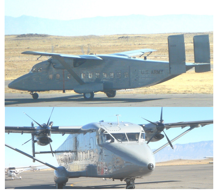
An Army "Short Sherpa" (C-23) stopped through Double Eagle II Airport after Thanksgiving. It was manufactured by Short Brothers in Belfast, Ireland and has a rear cargo loading ramp.

!DCA 11/083 GAI AD PTCHY ICE WEF 1111060220 (AT GAITHERSBERG, THE WHOLE AIRPORT IS COV-