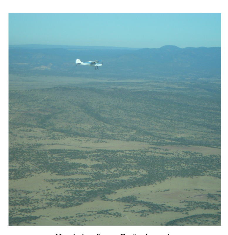
Headed to Santa Fe for brunch.