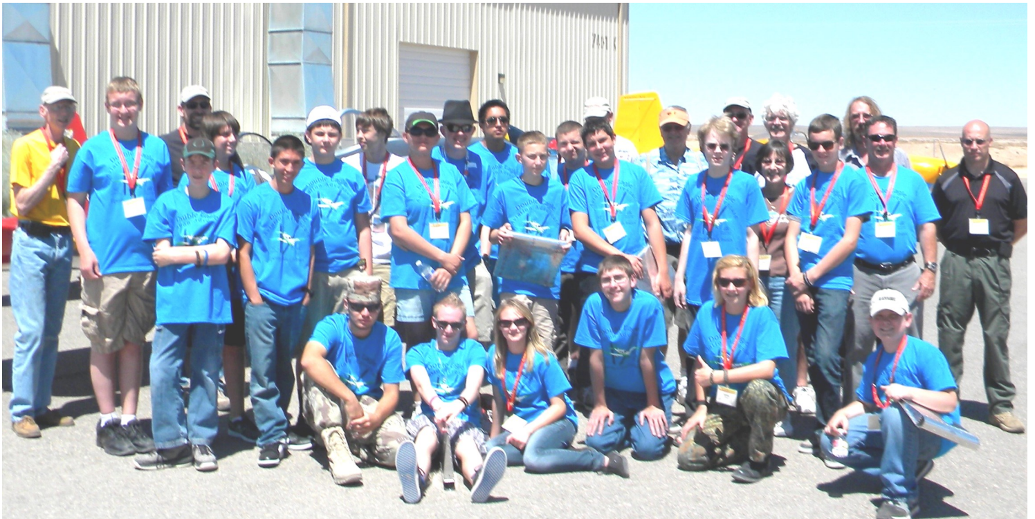
2013 DEAA Class and Staff