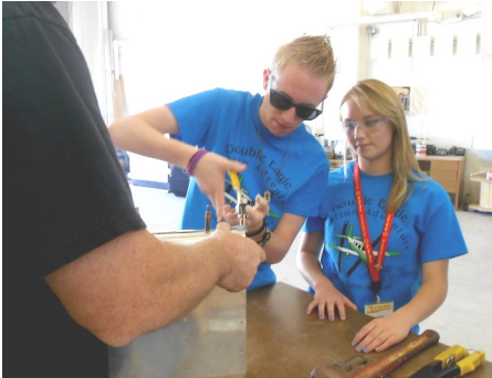
DEAA students learned to rivet an airfoil

Students were honored with a flyover salute by the Chile Flight formation flying team