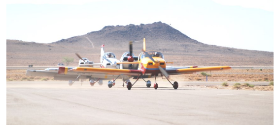
Chile Flight arrives in style to teach aircraft building class