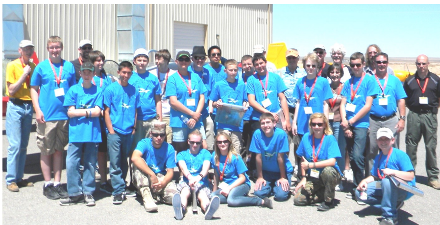
DEAA. See page 5...