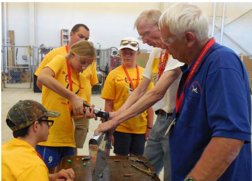
DEAA. See pages 5-7

Chapter 179 meetings are on the third Tuesday each month.