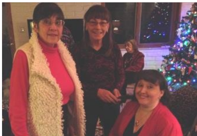
EAA Chapter 179 Christmas Party

Chapter 179 meetings are on the third Tuesday each month.