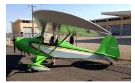
Double Eagle Aviation Adventure 2016 – What FUN!