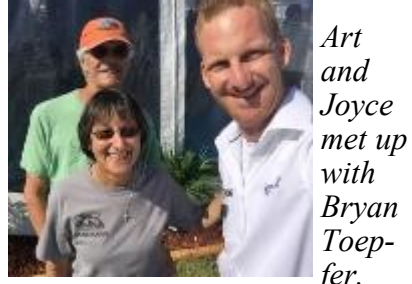
fer, now with the Rotax part of Aircraft Spruce.