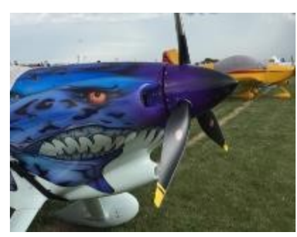
Paul Dye (Kitplanes) RV-3B, "Tsamsiyu", parked by the Woods' yellow RV-6A