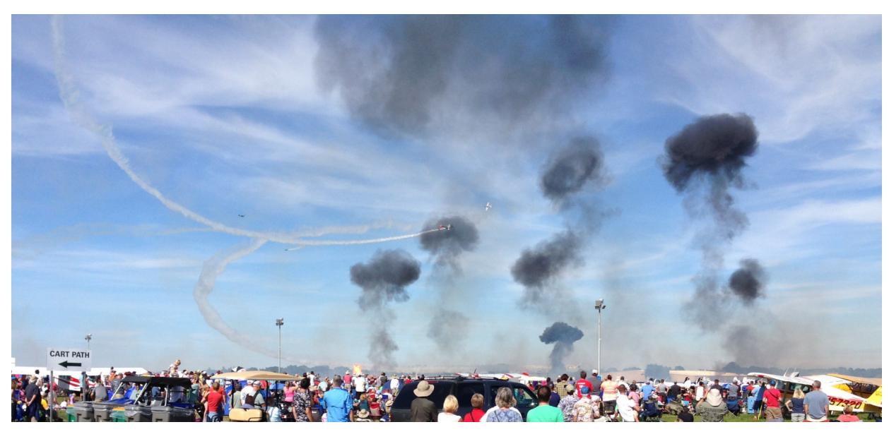
AirVenture Warbirds in action