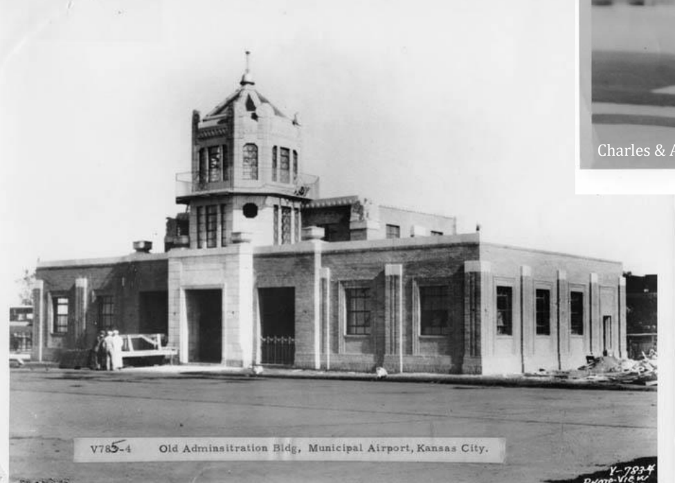
V785-4 Old Administration Bldg, Municipal Airport, Kansas City.