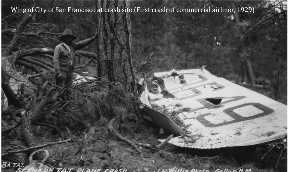
Wing of City of San Francisco at crash site (First crash of commercial airliner, 1929)