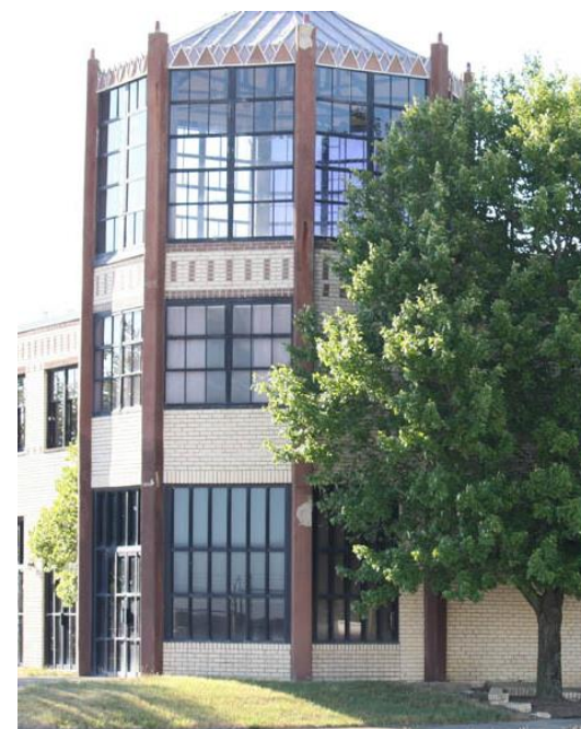
Port Columbus Passenger Terminal (Today)