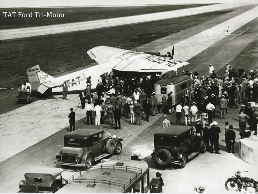
TAT Ford Tri-Motor