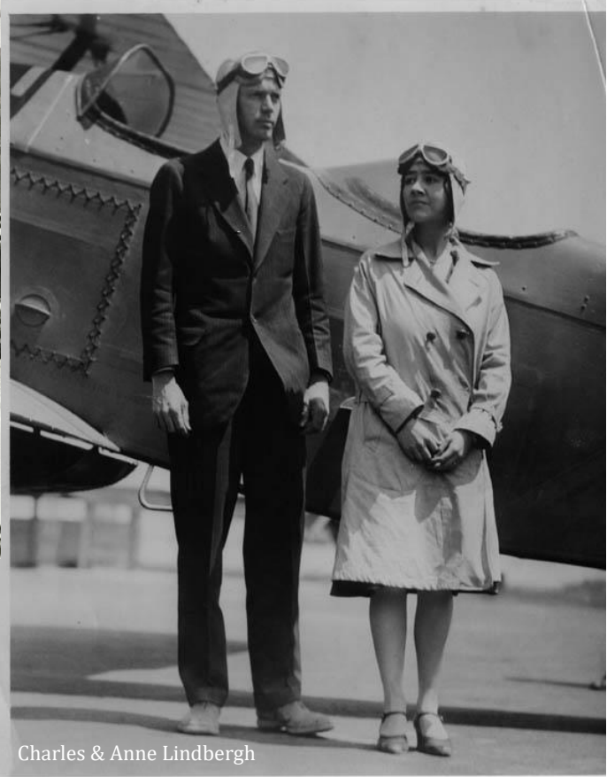
Charles & Anne Lindbergh