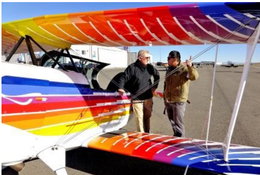
EAA Eagle Flights at KAEG. See pages 4-5...

Chapter 179 meetings are on the third Tuesday each month, except in December when replaced by our Christmas Party.