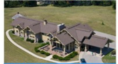
EAA Air Academy Lodge is the hub of activity, where students eat, sleep and make new friends