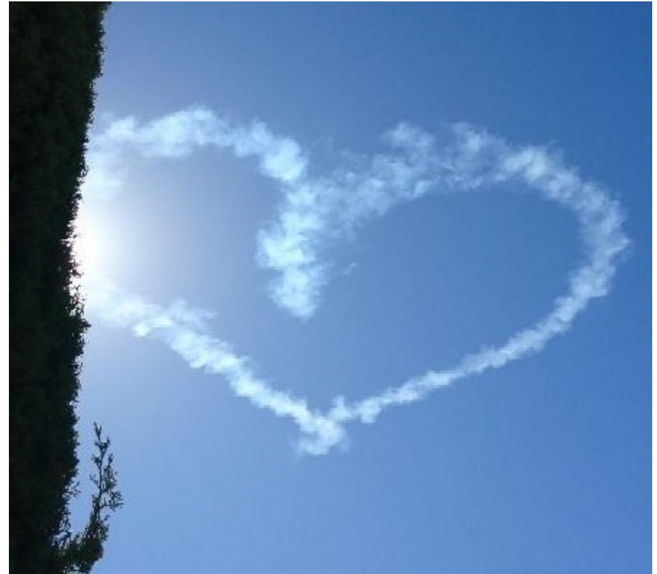
Rio Grande: Chile Salute, captured by Sky 7

page . Our posts reached 18,000 people, thanks to some 197 shares!