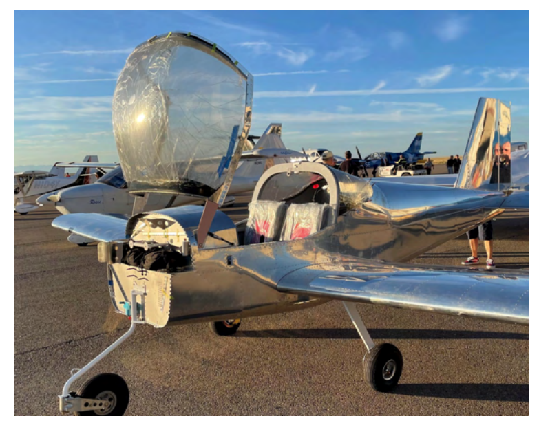
Our RV-12 on display and LOEFI.