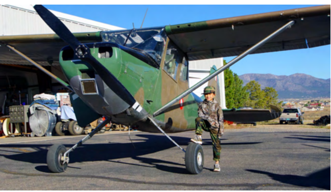
Tanner kickin' the tires