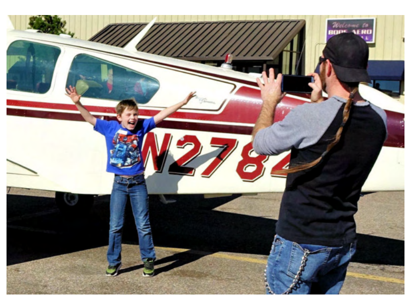
And after the flight ... Big Smiles.