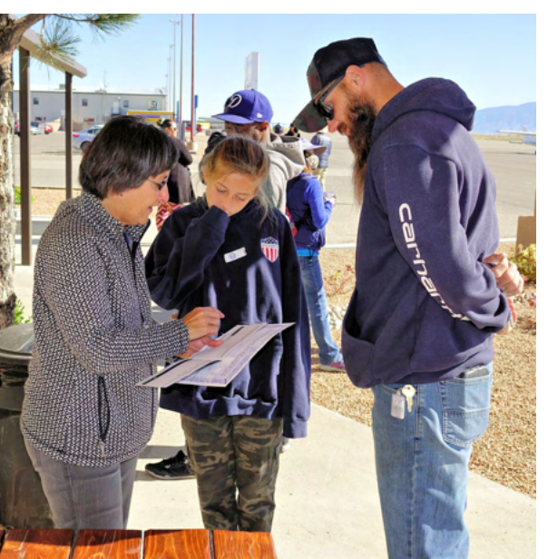
Each Young Eagle receives a Certificate and an entry in their Young Eagles Logbook.