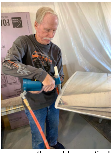
Work continues apace on our RV-12. There is much detail work to be completed while we wait for arrival of the motor mount (we have the prop and motor itself on hand now).