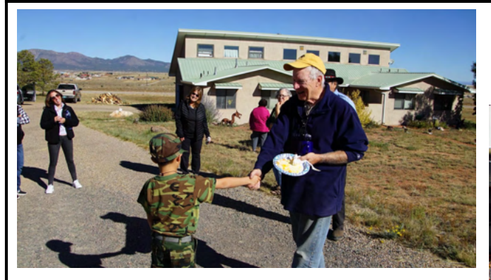
Everyone getting to know each other... smiles all around!