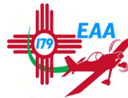
Eagle II Airport.