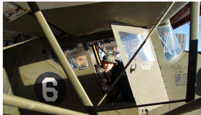
John, you comin'?