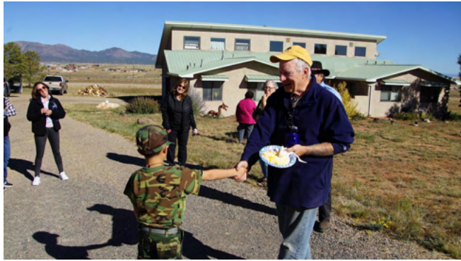
Everyone getting to know each other... smiles all around!