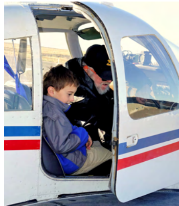
Then its time to introduce the Young Eagle to the cockpit and to get them settled, ready to go flying.