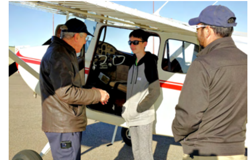
Pilots introducing Young Eagles (and their parents) to the airplane and to the flight which the Young Eagle is about to take.