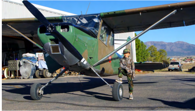
Tanner kickin' the tires