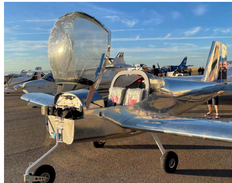
Our RV-12 on display and LOEFI.

Work continues apace on our RV-12. There is much detail work to be completed while we wait for arrival of the motor mount (we have the prop and motor itself on hand now).