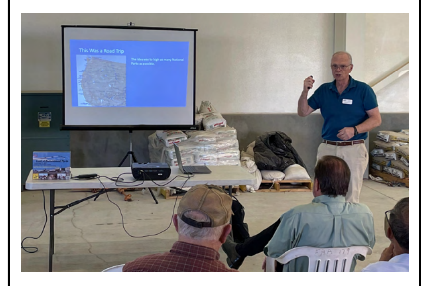
The planned route and schedule was supposed to be ....