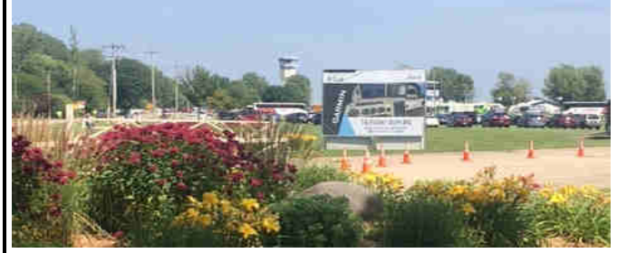
Looking towards the OSH tower. A beautiful morning.