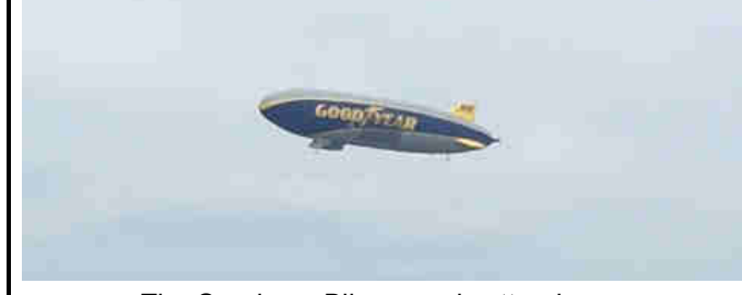
The Goodyear Blimp was in attendance.

A Heritage Fly-By 2 Corsairs and 2 F-18s.