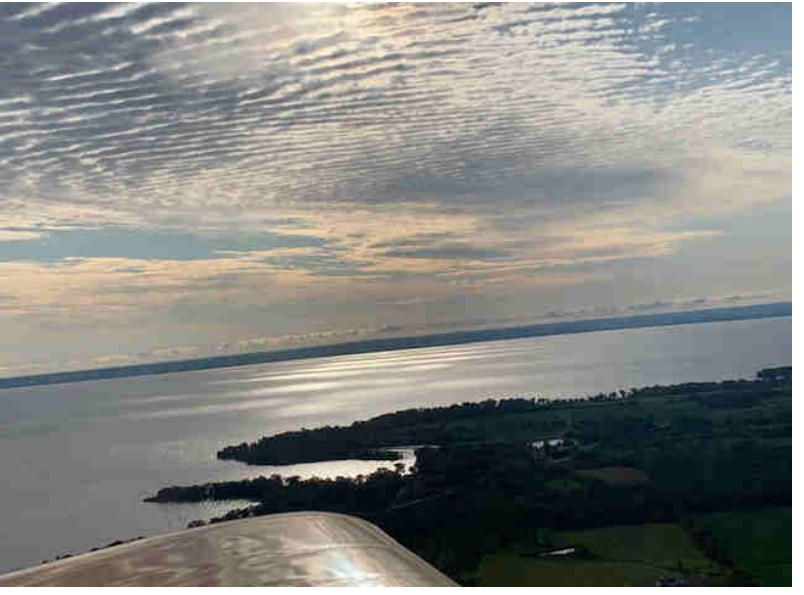
Gorgeous view of Lake Winnebago on KOSH departure