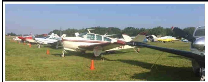
Parked in the South 40, again, after a Sunday morning arrival.