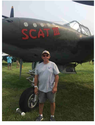
The ultimate WWII fighter in the eyes of many, the P-38. "Scat III"