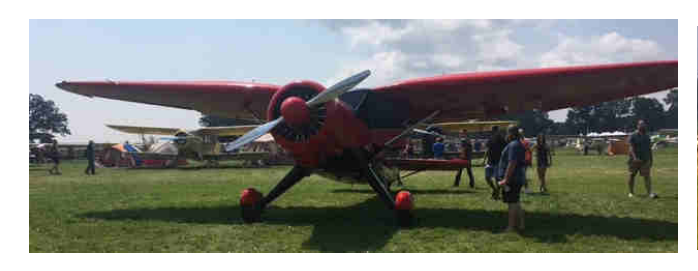
A big Reliant.