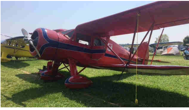
More vintage aircraft on the line.