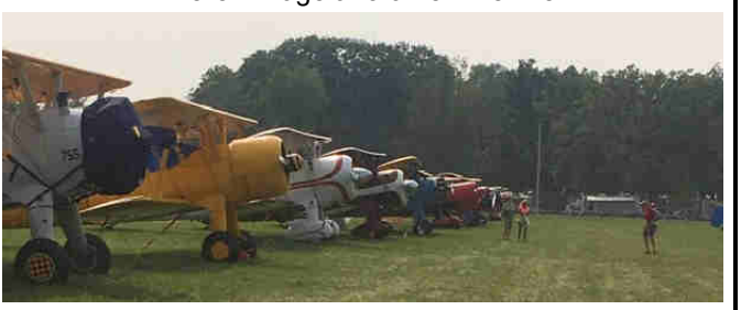
Who doesn't like biplanes?

A Heritage Fly-By 2 Corsairs and 2 F-18s.