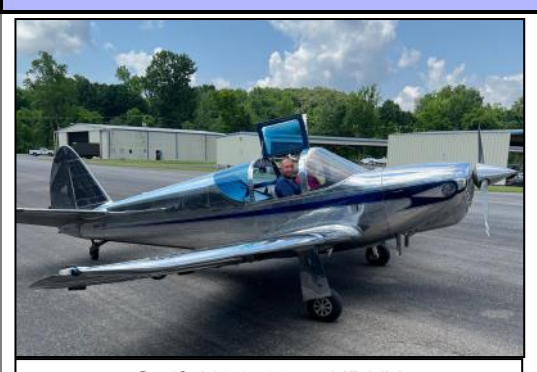
Swift N84799 at KDKX