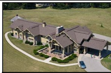
EAA Air Academy Lodge, Oshkosh,

EAA conducts various weeklong camps designed to introduce young people to the aviation world. Campers are engaged in a variety of hands-on activities while staying at the EAA Air Academy Lodge at Oshkosh.