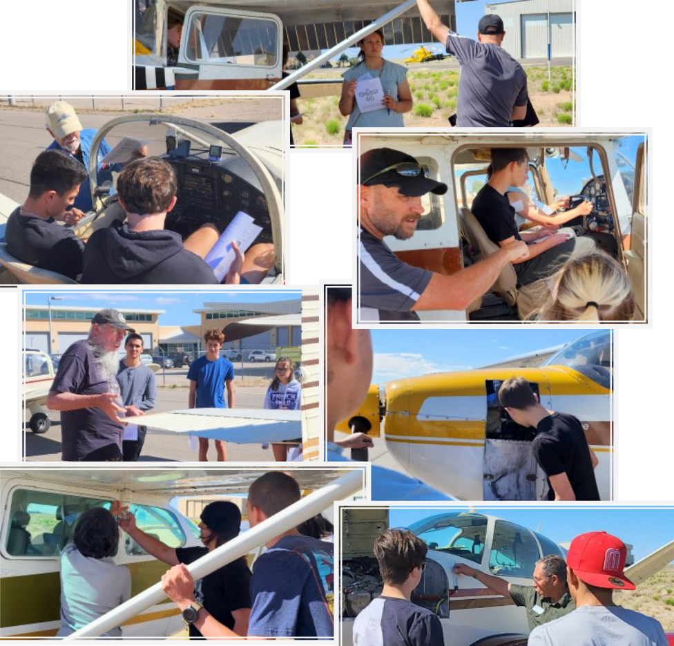
Full report in July Newsletter.