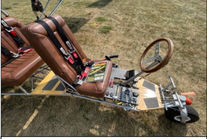
The Breezy "cockpit"