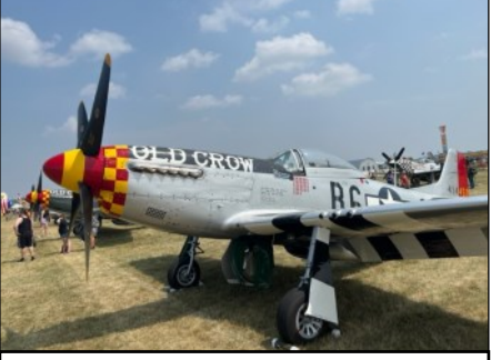
One of many P-51Ds in the Warbird