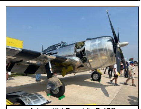
A beautiful Republic P-47C