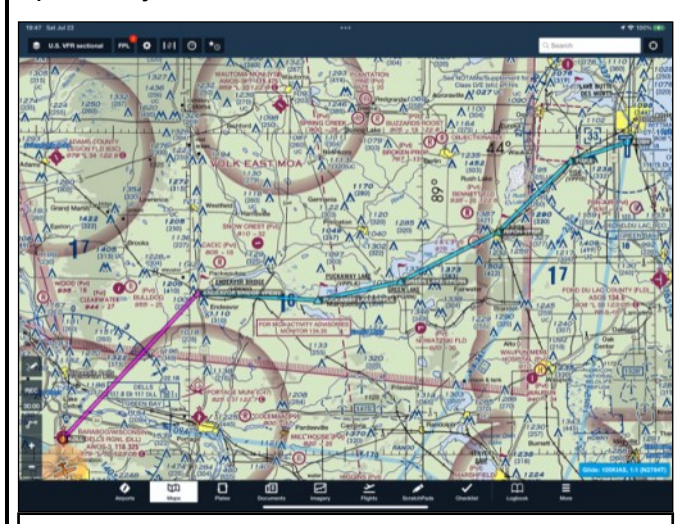
The arrival and waypoints to Oshkosh (red and blue lines)

day. I thought that Oshkosh Wisconsin would be generally cooler and although maybe a bit more moist, it would be bearable. I was totally surprised by what we encountered!