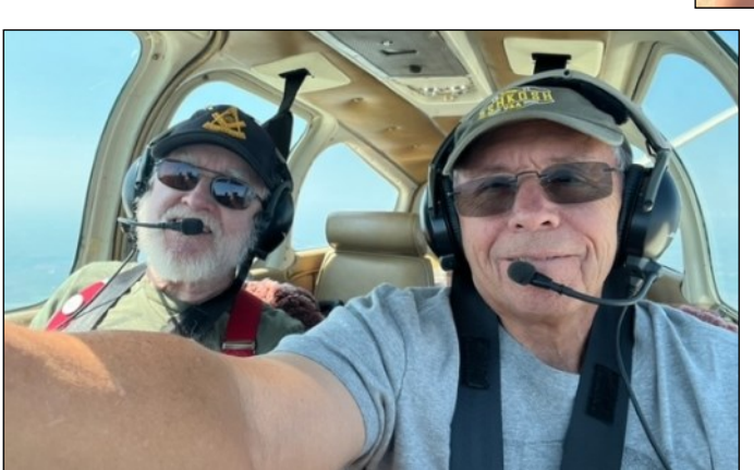
Two happy campers enroute to the world's largest Airshow!