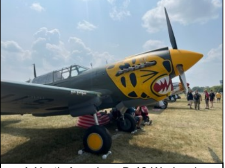
A North American P-40 Warhawk

Most attendees come for the airplanes, as you might imagine. Seeing kids of all ages and adults excited about the airplanes here, is gratifying to see. I get excited to see the all the airplanes myself. That palpitation that you get in your chest and that ear-to-ear smile on your face is just all enveloping. It is so very thrilling to see this many airplanes all at once, all in the same place. The aircraft here come in just about every conceivable shape, size and color. The noise can sometimes be deafening, but to many here, it is the sweet sound of joy! This Gathering has to be seen to be believed. I really do not do a very good job of describing it with words, so I am attaching several pictures to try to help you understand the magnitude of Oshkosh. Enjoy!