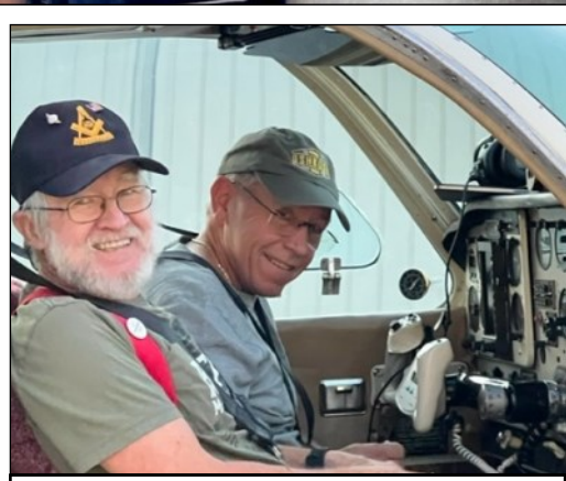
And .... Pre-departure smiles!