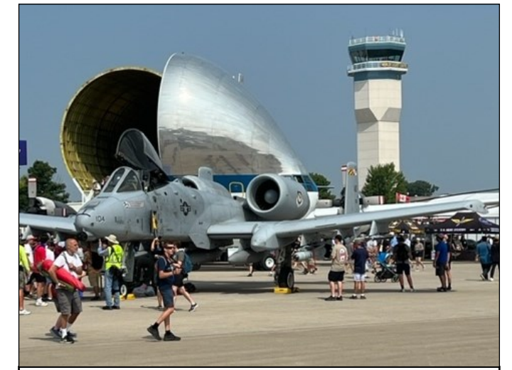
The "World's Busiest Control Tower" standing watch over the large aircraft display! (A-10 and Super Guppy)

On the airshow flight line with familiar friends!