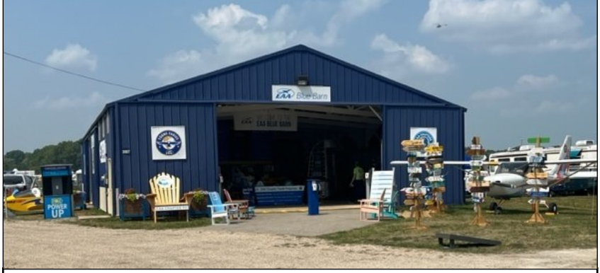
The EAA Blue Barn

very hot and very humid in Oshkosh this week. We had strong storms with copious amounts of rain and wind on three different nights, with lightening and thunder to complete the picture. While it cools off a bit by morning, the sun makes the afternoons almost unbearable. The very large vendor buildings are hot, with no cooling or overhead fans, and with the multitudes of people inside, the heat is daunting. There are ways to cool off, so everyone is looking for that