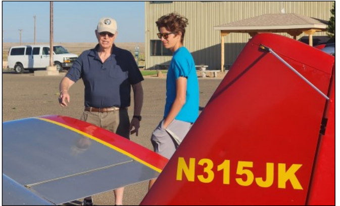
Snapshots from the July Young Eagles flights.

Participants were shown the complete preflight procedures, and in flight were given the opportunity to fly the airplane themselves.