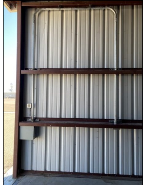
Electrical work—a super fan for improved temperature control, and relocating electrical wiring in preparation for installing the "people door".