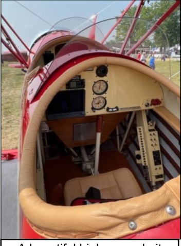
A beautiful biplane cockpit