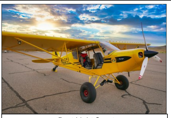
Best Light Sport Janet Crosby, Zlin Savage iCub - LSA