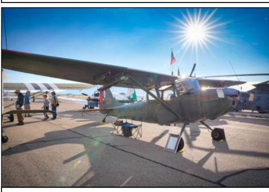
Best Warbird Phil Phillips, Cessna L-19 Bird Dog