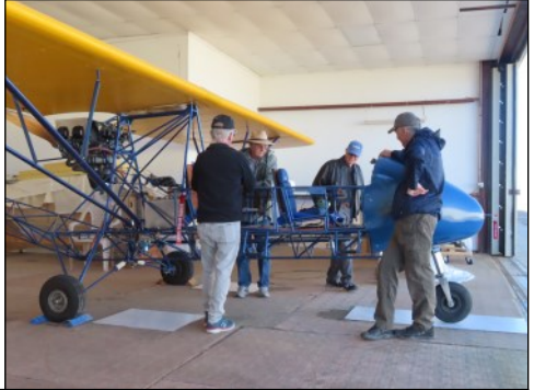
Preflight confab: final check of the airplane and plans for this first flight.

Spoiler alert, the first flight went off without a hitch. Warren has done a superb job building the airplane and it flew exactly as an airplane should.