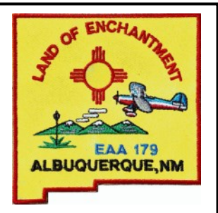
LOEFI Patches over the years