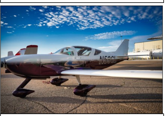
Best Kit Built Tom Dollmeyer, Glassair Super II FT