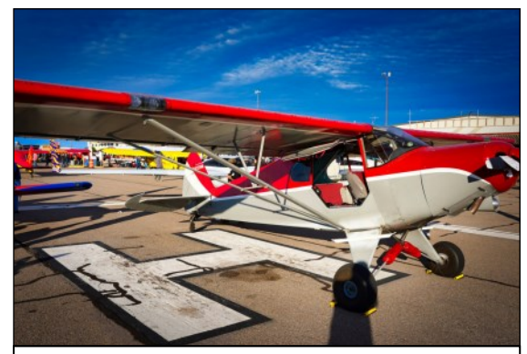
Best Classic Airplane Larry Shepken, Piper PA-12 Super Cruiser