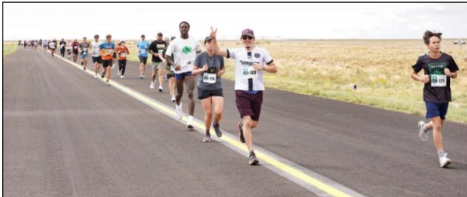
Here they come! Serious RACERS!