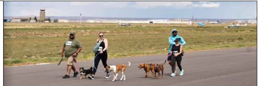
Here They come! MUTTS aSTRUTTING