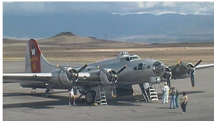
B-17, Aluminum Overcast, at KAEG. See page 6...

Chapter 179 meetings are on the third Tuesday each month, except in December when it is replaced by our Christmas Party.