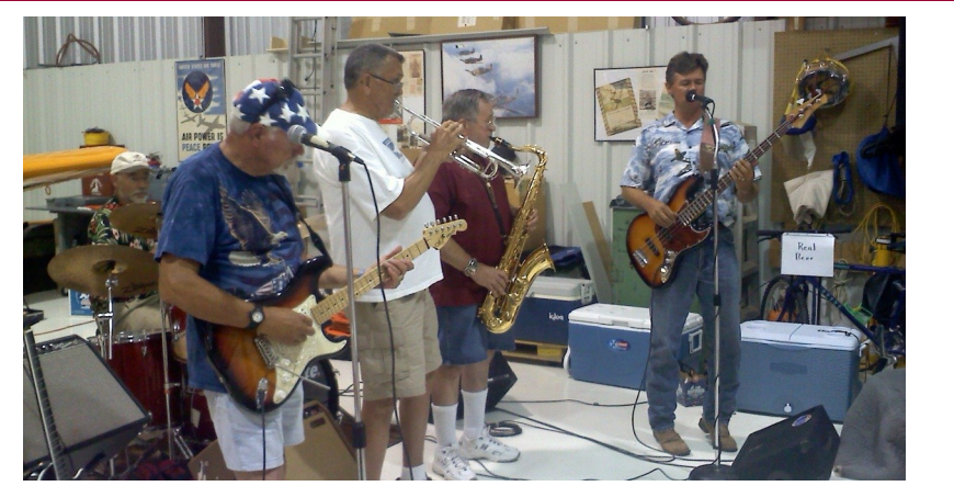
Hangar Party! See page 7...