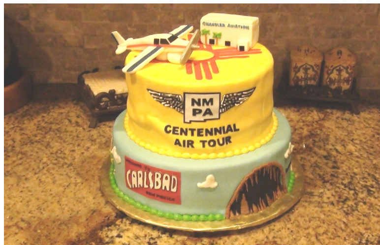
NMPA Centennial Air Tour. See inside...

Chapter 179 meetings are on the third Tuesday each month.