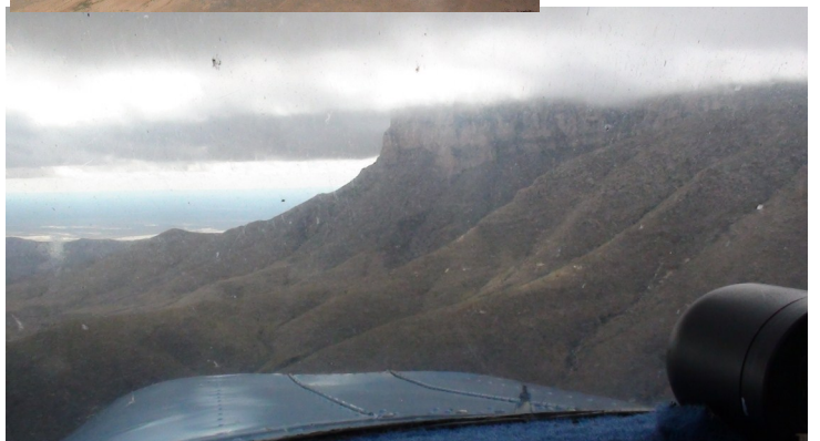
NMPA Centennial Air Tour, Headed for Santa Teresa and the War Eagles Air Museum , from Carlsbad. I went into Texas to stay under the clouds.