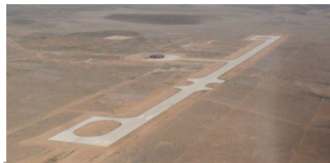
We flew over the Space Port on our way to Socorro