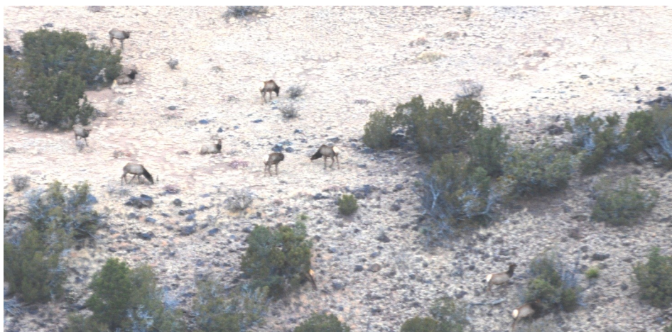
Elk, see page 5...

Chapter 179 meetings are on the third Tuesday each month.