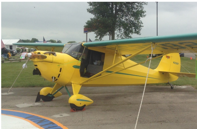
AirVenture (See page 9)

Chapter 179 meetings are on the third Tuesday each month. However, Our August meeting this year is replaced this year by our Golden Anniversary Celebration. See information above.