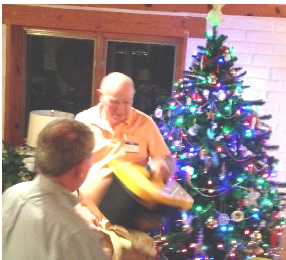
Christmas Party Pictures... see page 3

Chapter 179 meetings are on the third Tuesday each month.