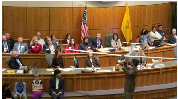
Zuni becomes NM State Sailplane 2015

awards. Just to name a few are induction into the Soaring Hall of Fame in 1999, the EAA Major Achievement Award in 2005, induction into the Moriarty Airport Hall of Fame in 2010, and recently the Applebay Zuni became the official New Mexico State sailplane.