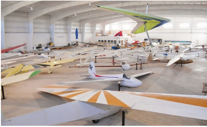
Southwest Soaring Museum