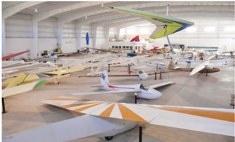
Southwest Soaring Museum

Chapter 179 meetings are on the third Tuesday each month.