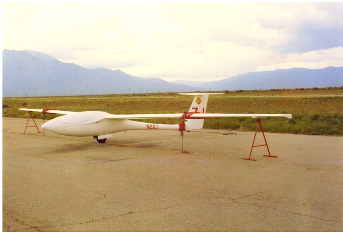
N22J Zuni II