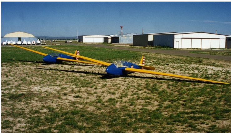
TG-4A SW Soaring Museum