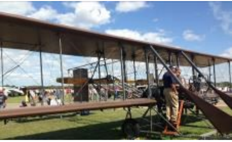
Wright Flier replica