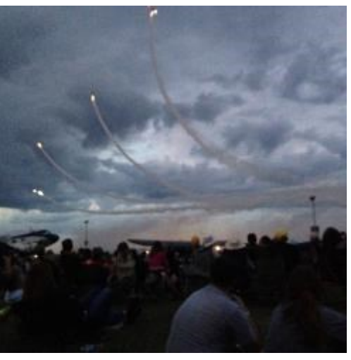
Night Air Show