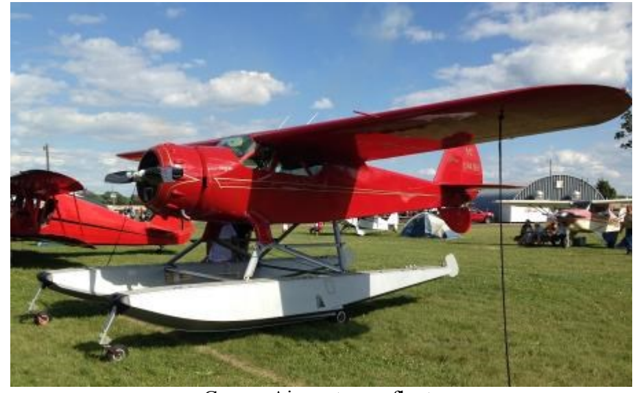
Cessna Airmaster on floats