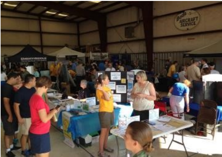
EAA Chapter 179 booth