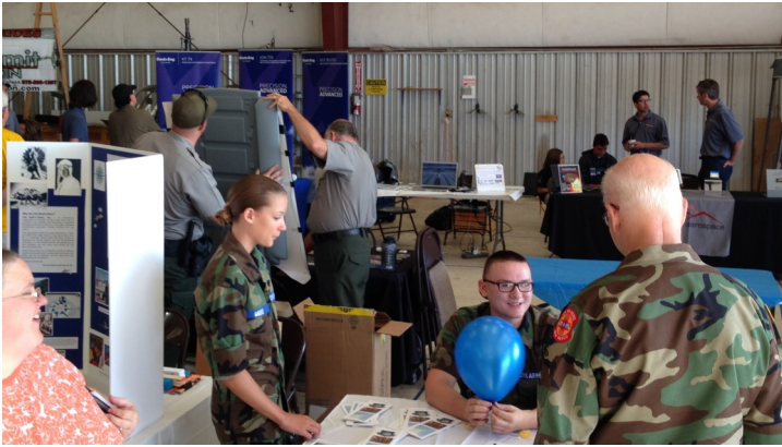
Civil Air Patrol