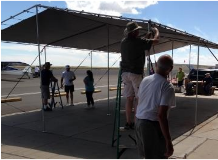
Getting ready by putting up shade