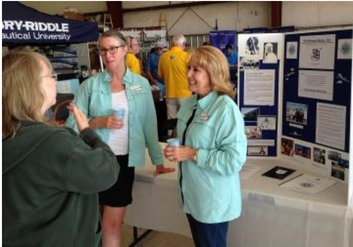
Ninety-Nines, Rio Grande Norte Chapter (women pilot organization for women who love to fly)