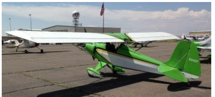
1979 plans built Pober Pixie, used to take the aerial photos on this page.