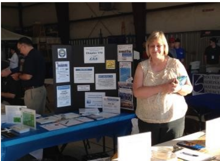
Ready for guests