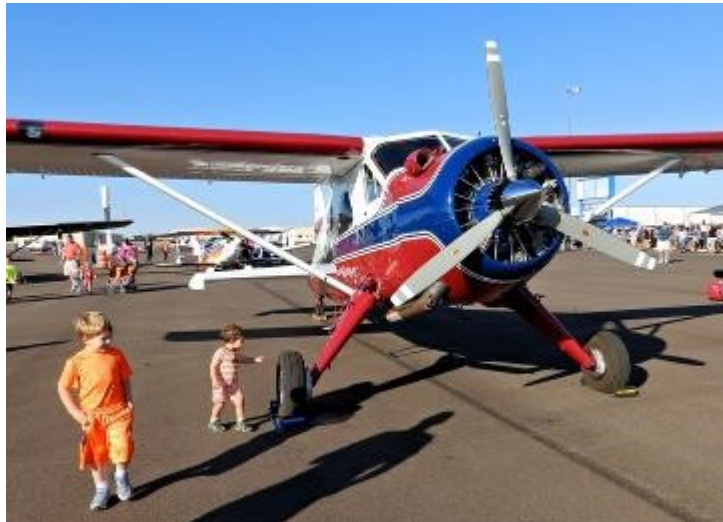
Under dad's watchful eye