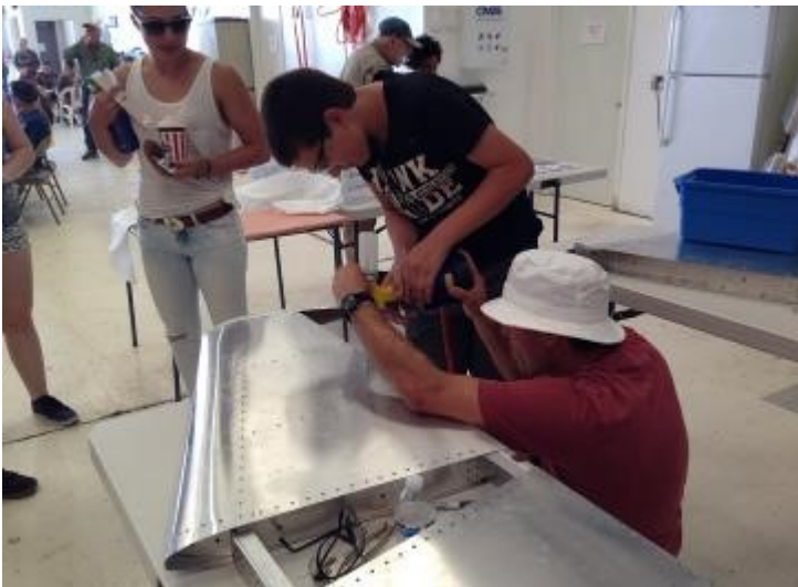
Riveting a new stabilizer