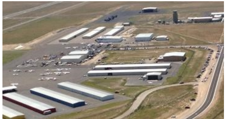
LOEFI 2015, KAEG, 1:25 PM