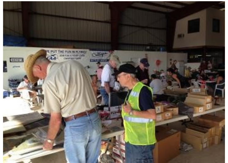
Chapter 179 Fly-Market