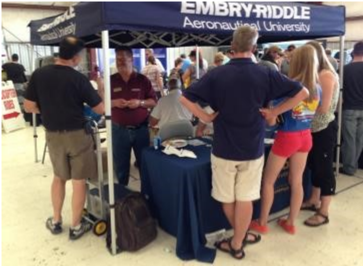
Emery-Riddle Aeronautical University