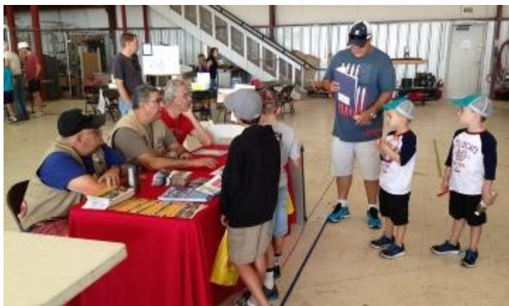
National Museum of Nuclear Science & History