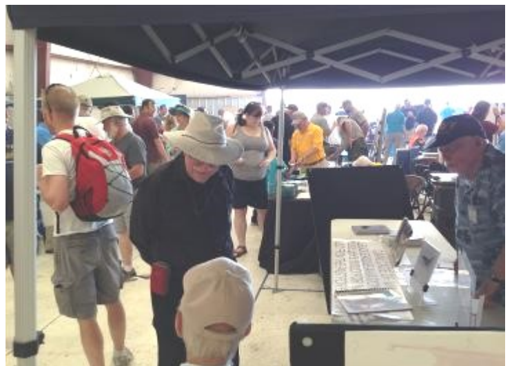
Cavalcade of Wings Albuquerque Aviation History