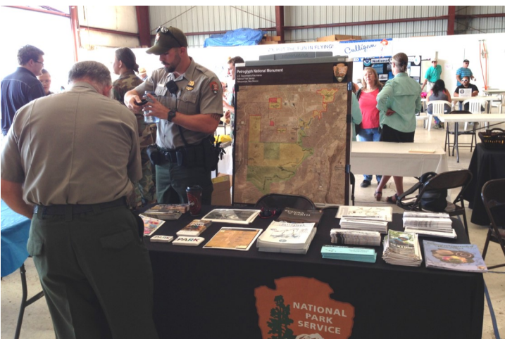
National Park Service