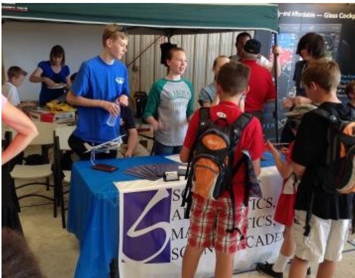
Southwest Aeronautics, Mathematics, & Science Academy