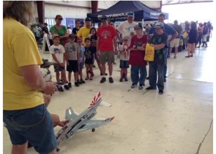
How it works demonstration by Duke City Electric Flyers