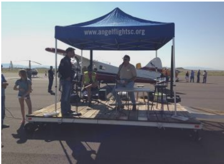
Interview and announcing stage