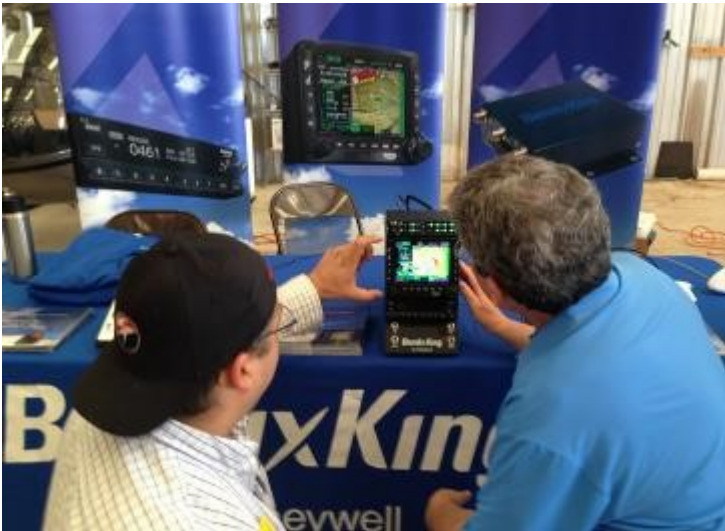
BendixKing by Honeywell