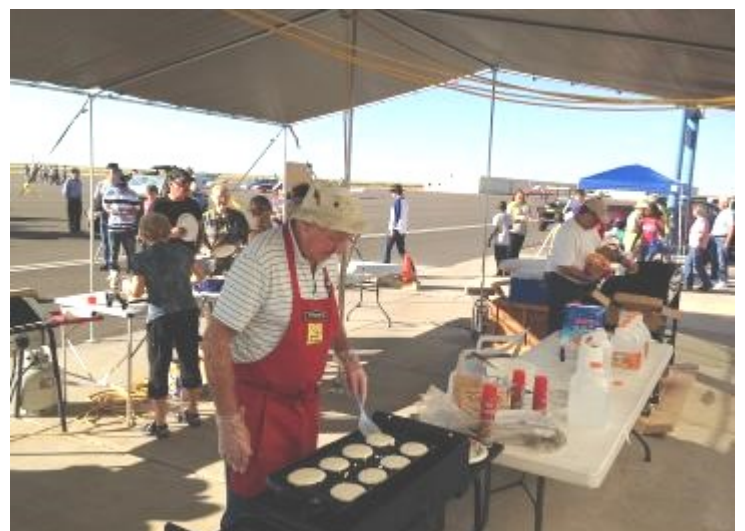
Chapter 179 volunteers serving breakfast