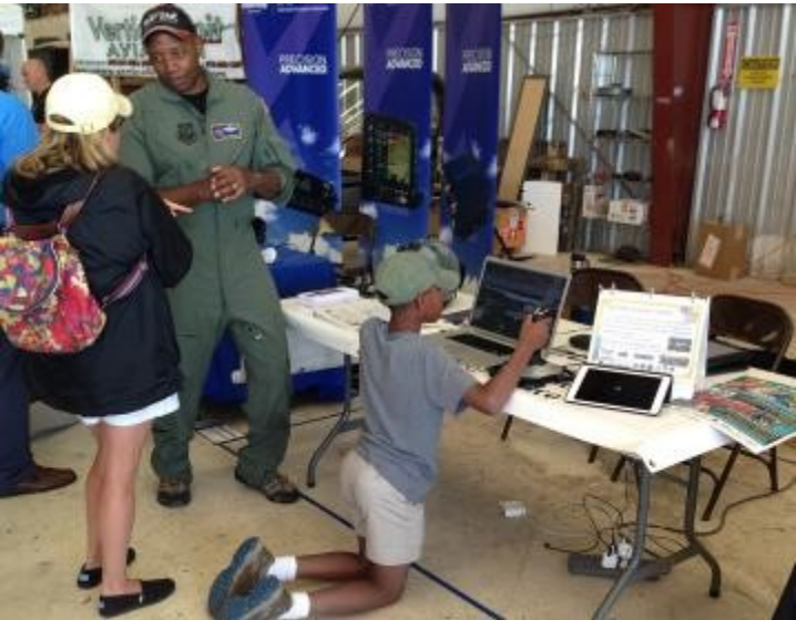
Tuskegee Airmen Gen Lloyd W. Newton Chapter