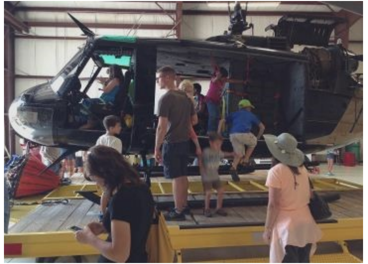
Up close and hands on