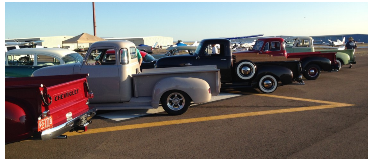
Car show ready