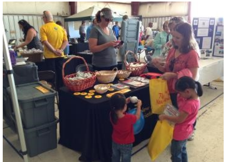
Fly New Mexico