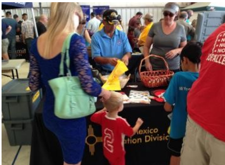
New Mexico Aviation Division