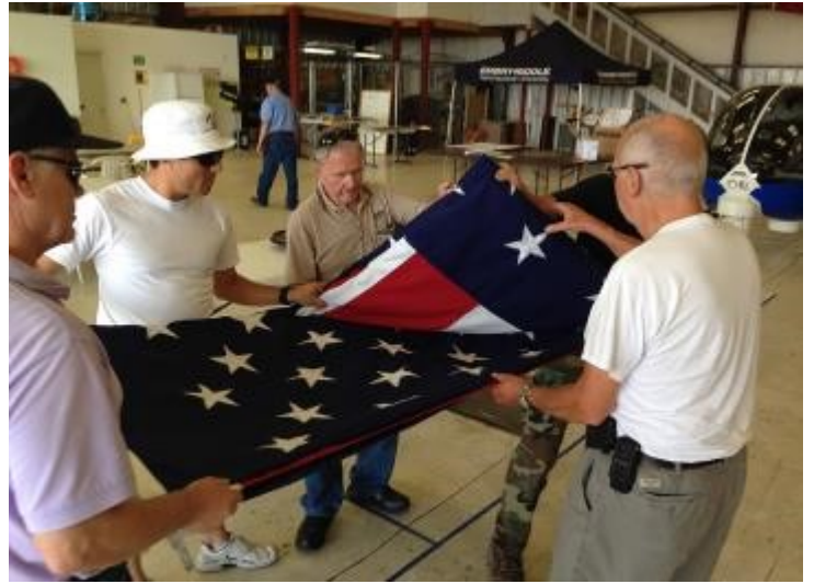
Folding the flag for the start of the Fly-In next morning.