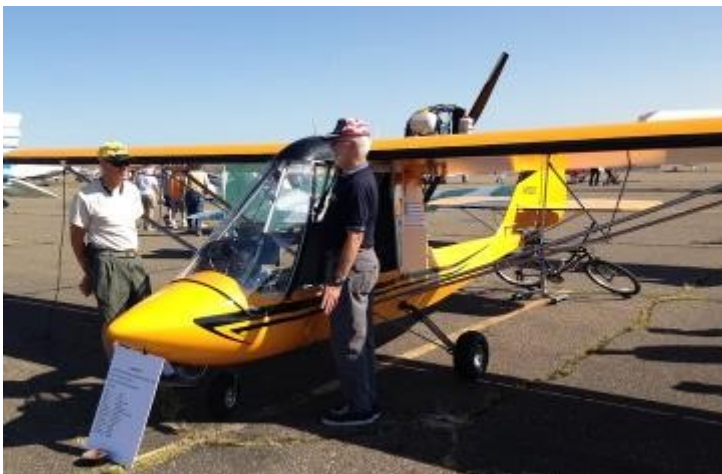
2015 Excalibur, built by Dan and Zia Telfair of Albuquerque, EAA Chapter 179 members