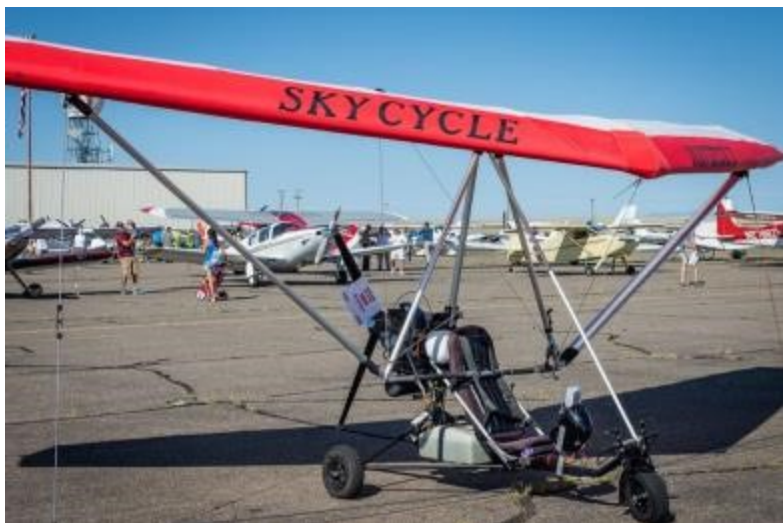
Best Light Sport: Jerry Jacksha's Skycycle Trike