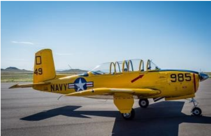
Best Vintage: Cindy Crawford's Beechcraft T-34