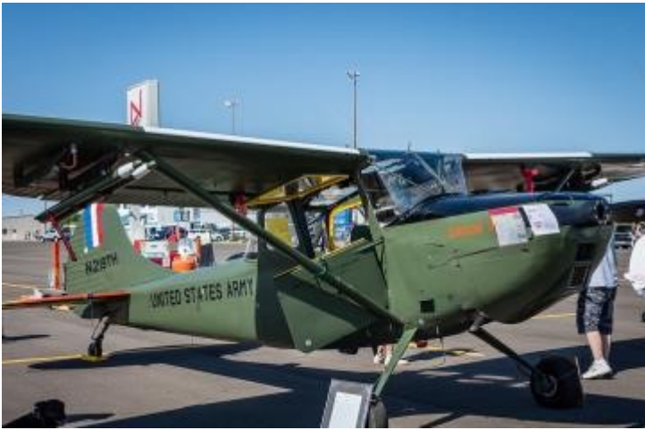
Best Warbird: Phil Phillips' L-A/0-1 Bird Dog