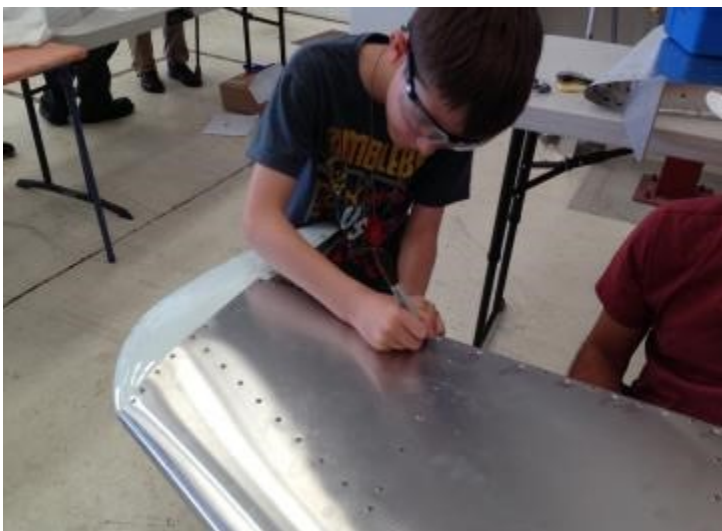
Signing his rivet