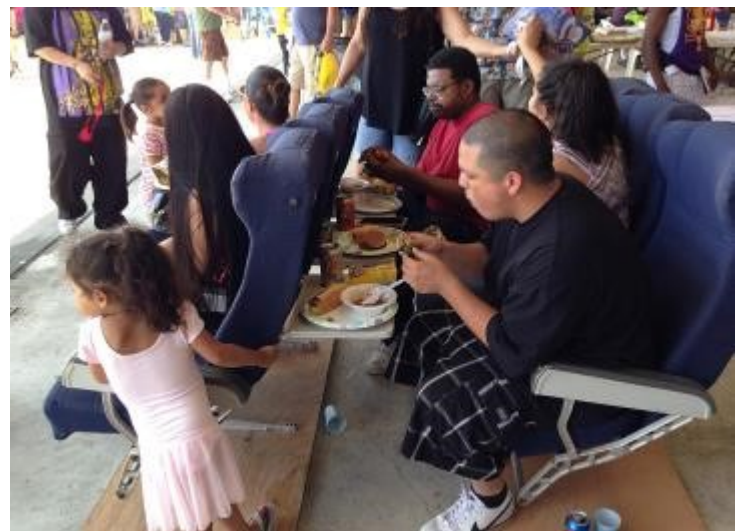
Kind of like an airline meal with a view