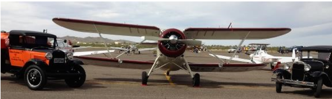
1937 fuel truck, Waco, car