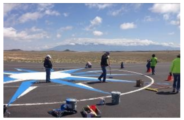
Ninety-Nines re-painting the Compass Rose at KAEG