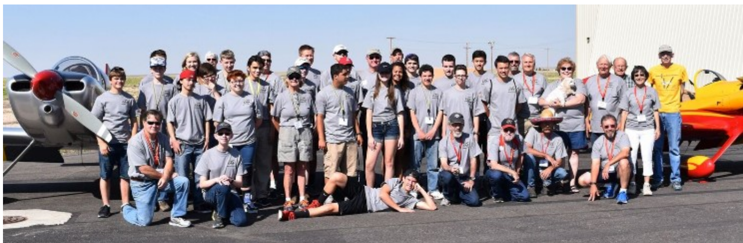
DEAA class of 2016