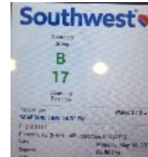
Gwen got a lucky boarding pass (B 17) for the trip back to ABQ