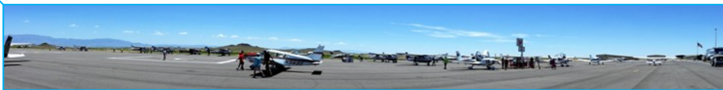
Pano view of the refueling line for the Air Race Classic

I Hope you all are having a wonderful summer; we'll see you at the next meeting! -WT