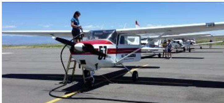
Air Race Classic (see page 7...)

Chapter 179 meetings are on the third Tuesday each month.