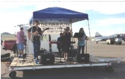
Calvary in the Meadows Worship Band