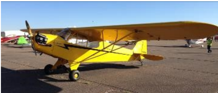
Oldest Aircraft - Kurt Winker, Los Lunas, Piper J-3 Cub (1942)