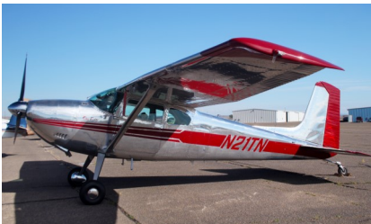
Furthest Home Airport - Tom Navar, El Paso, Cessna 180