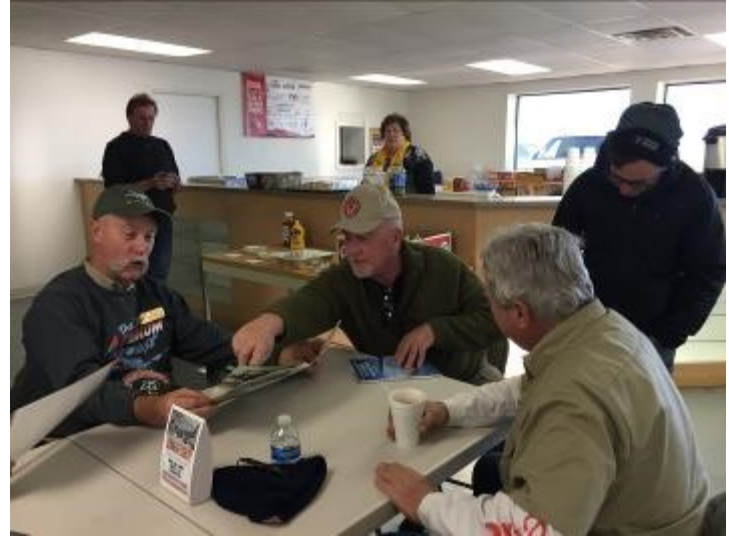
Family veteran photos and memories shared with crew and volunteers