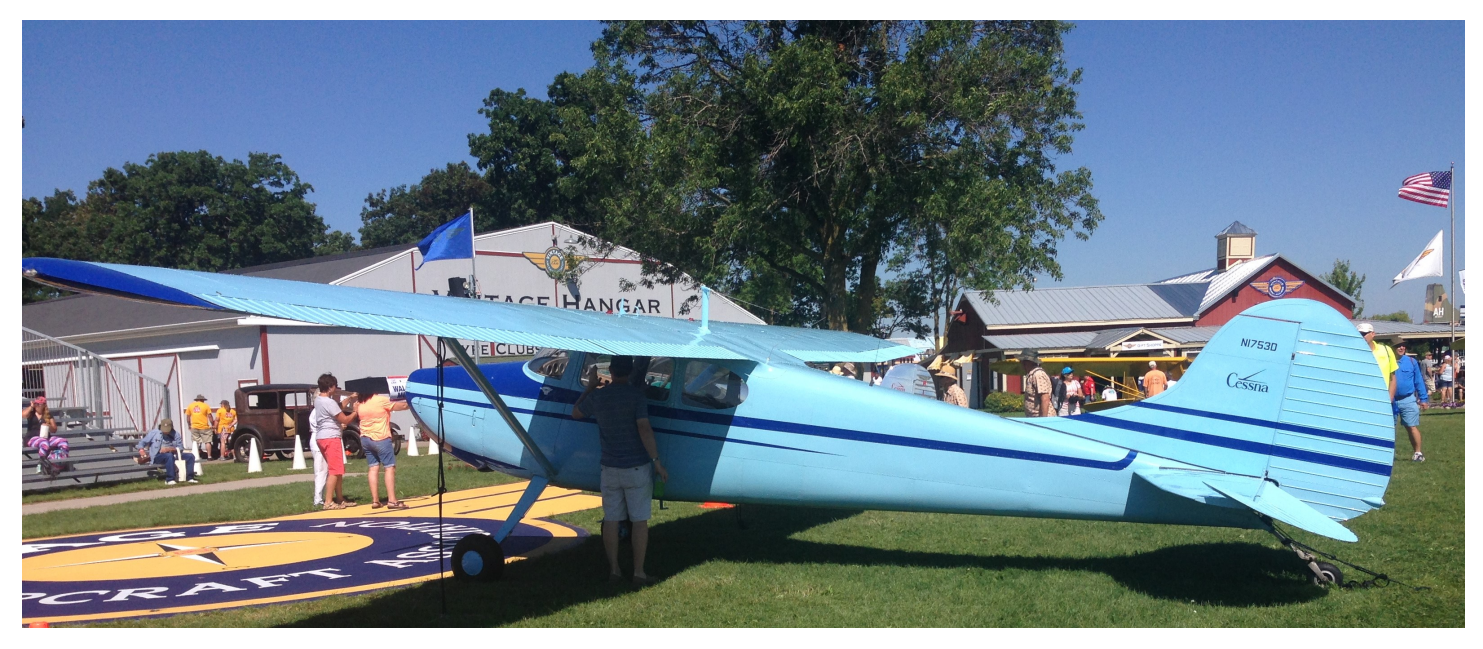
Beautiful Cessna 170 at the Vintage Barn.