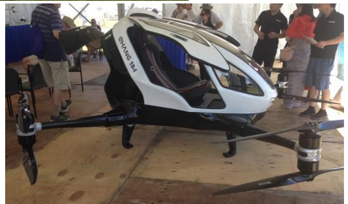
CHANG 184 : one pilot, eight propellers, and four motors (184). They showed movies of it flying with a pilot on board. No controls other than a computer that one tells where one