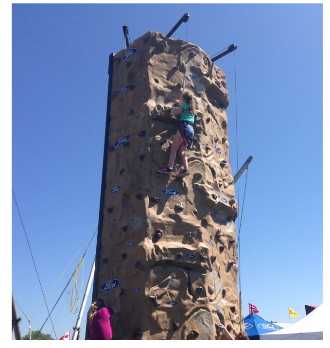
Rock climbing adventure.