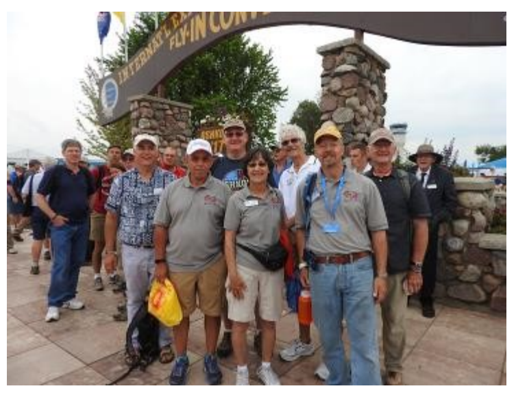
Chapter 179 gets together for a Chapter photo shoot in front of the brown arch.

LOEFI is almost here. I am looking forward to taking a lot of pictures for next months newsletter. HW