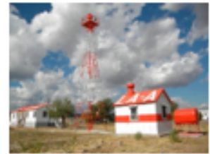
Airway Museum Cibola County Historical Society

PLAZA HOTEL LAS VEGAS NEW MEXICO — SINCE 1882 —