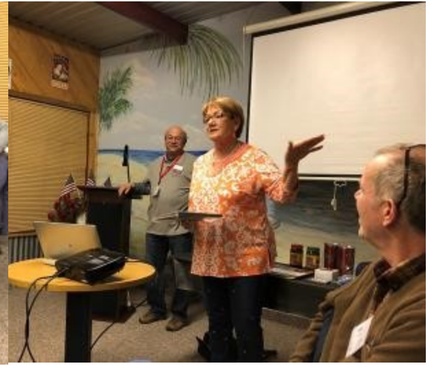
We were welcomed by the local Mayor