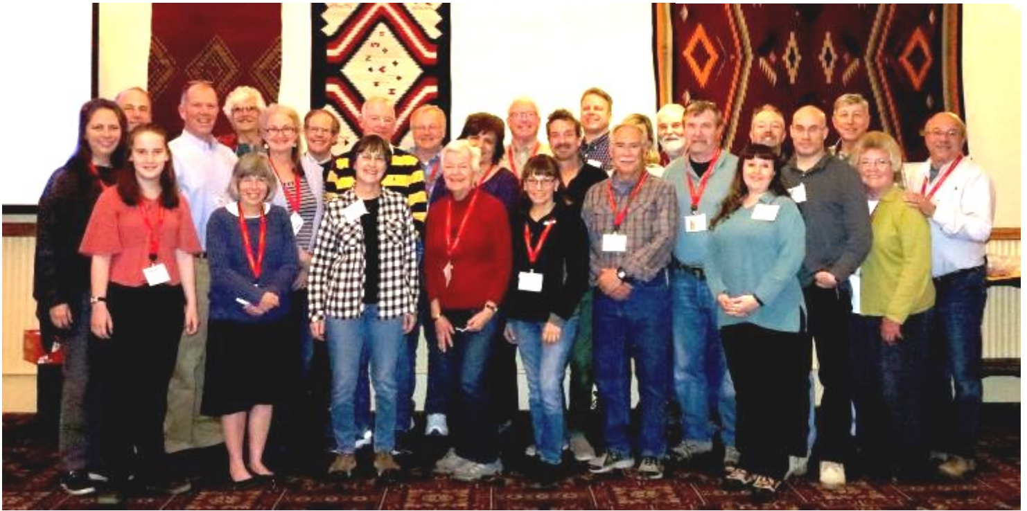
Route 66 Air-Tour Group Photo in Las Vegas, NM

We heard about all the outlaws and the wild West from the local expert.