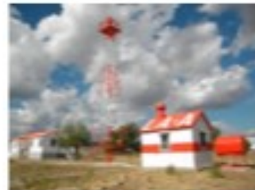
Airway Museum Cibola County Historical Society

Next time you visit there, be sure to check out their museum on the field. It is in one of the historic radio buildings used in the early days of aviation.