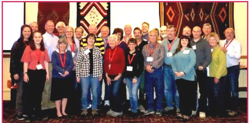
ROUTE 66 Air Tour group at Las Vegas, NM 2018 see inside...

Chapter 179 meetings are on the third Tuesday each month, except in December when replaced by our Christmas Party.