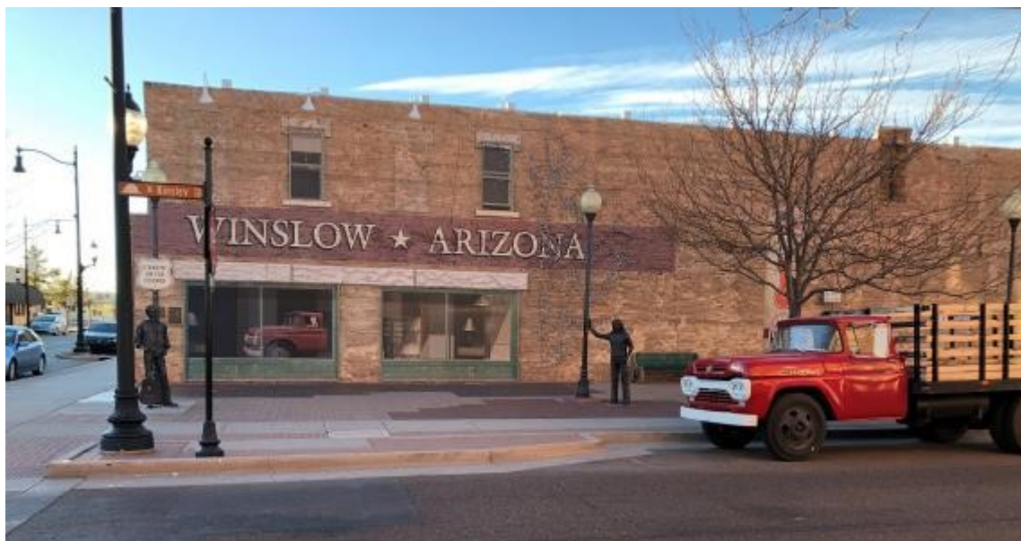
Standin' on the corner in Winslow, Arizona