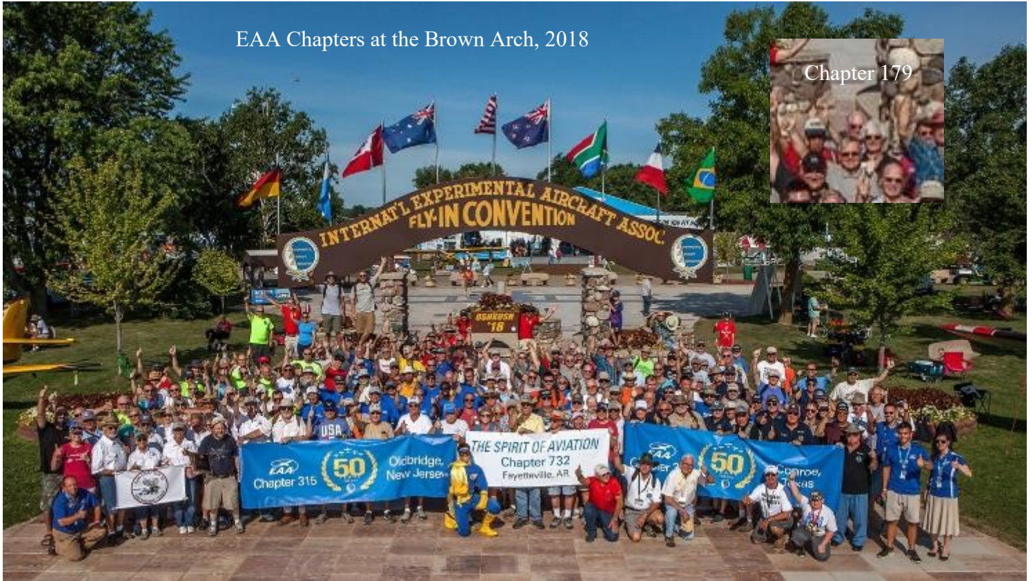
EAA Chapters at the Brown Arch, 2018