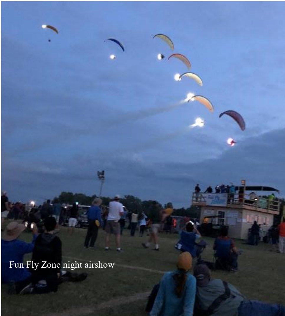
Fun Fly Zone night airshow