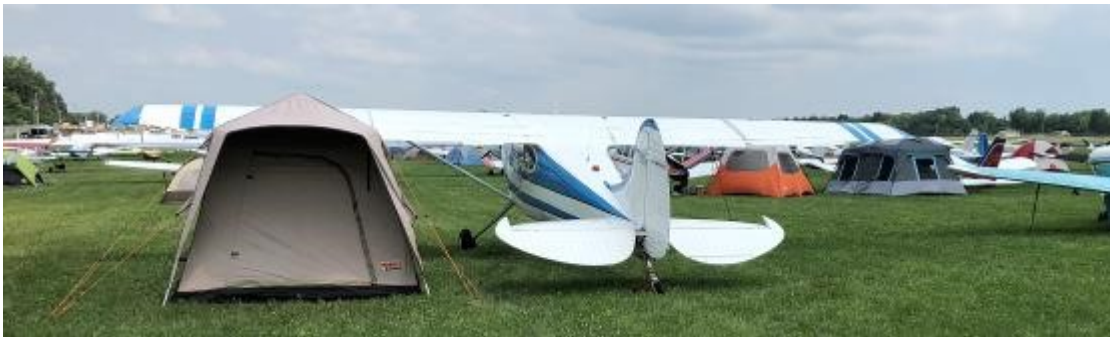
Me, Harley, camped in row 133 of Vintage Aircraft Camping