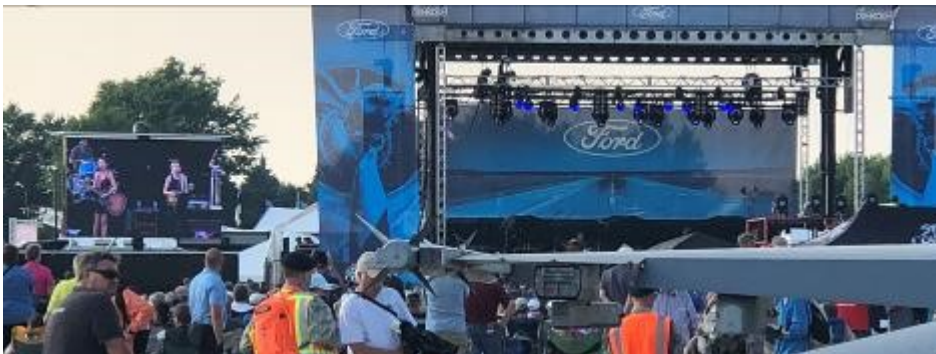
Concert Monday evening on Boeing Plaza, sponsored by Ford Motor Co.