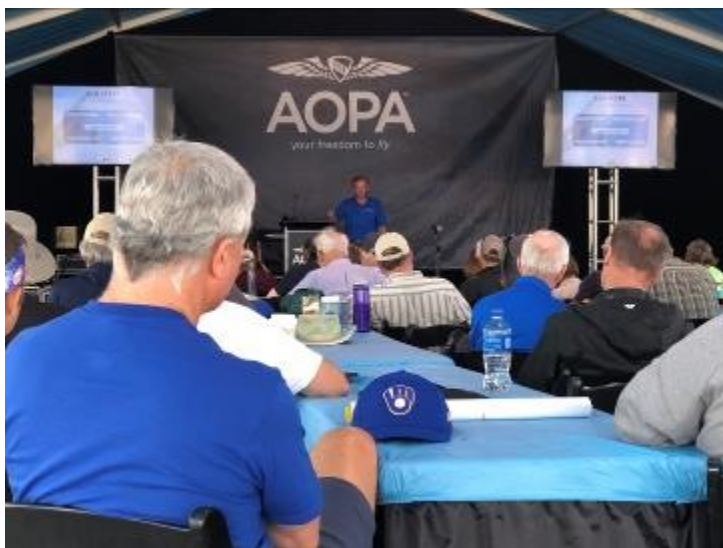
AOPA seminar by Sun Flyer on the future of Electric Flight