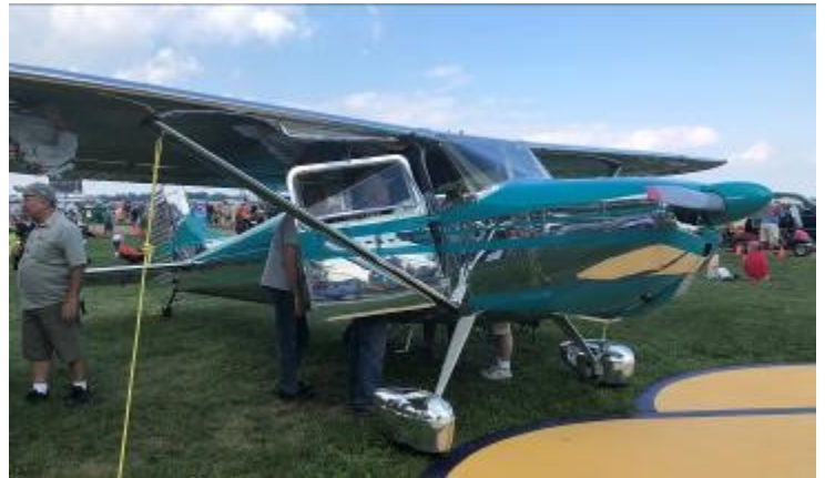
An exceptional Cessna 170 on display at the Vintage Red Barn.