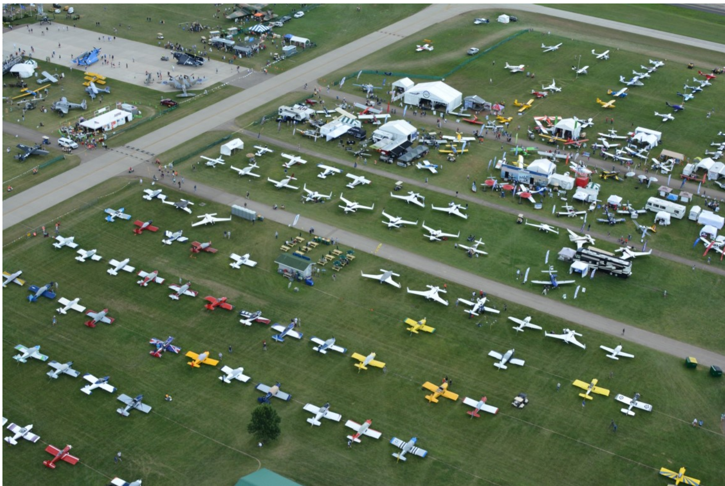
Photo by Bruce Hill, an RV7A builder/owner. Do you see Art & Joyce Woods RV-6A?