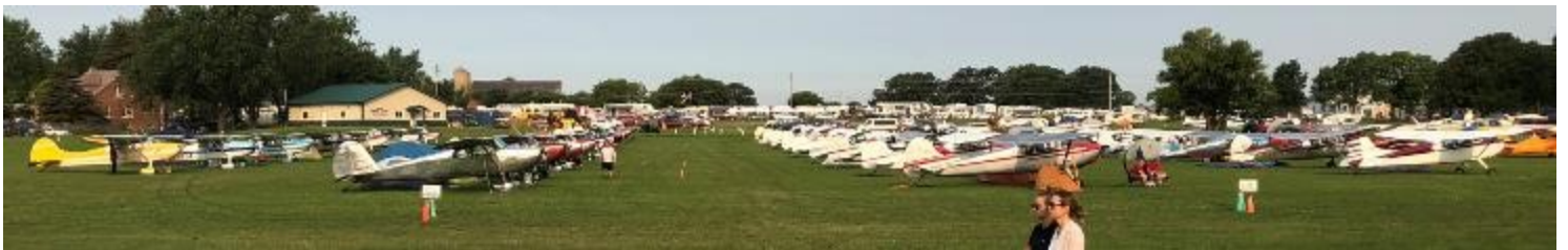
This was the 70th anniversary of the Cessna 170. Over 5,000 Cessna 170s were built (1948—1956) and over 2,000 are still in service today. Here are four rows of them.