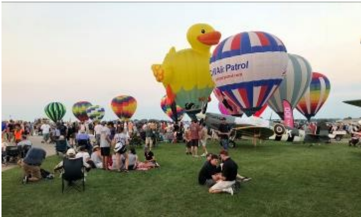
A balloon glow after the Ford Concert on Boeing Square.