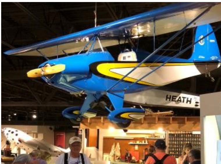
First Pober Pixie, at EAA Museum.