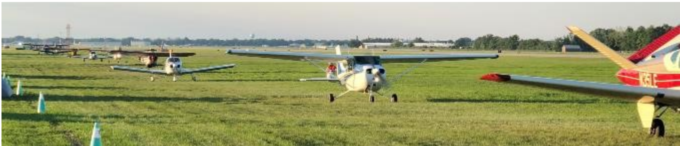
Vintage Aircraft Camping arrivals on Sunday afternoon.