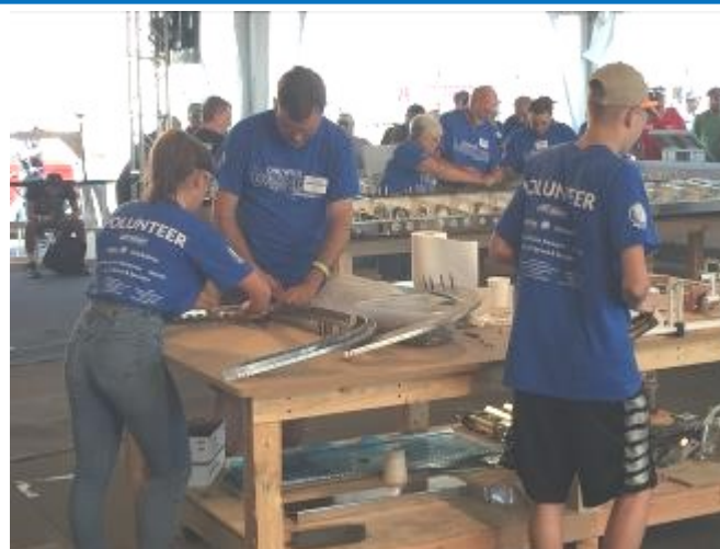
One Week Wonder at AirVenture

Chapter 179 meetings are on the third Tuesday each month, except in December when replaced by our Christmas Party.