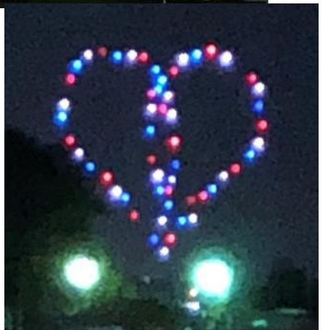
Drone night airshow