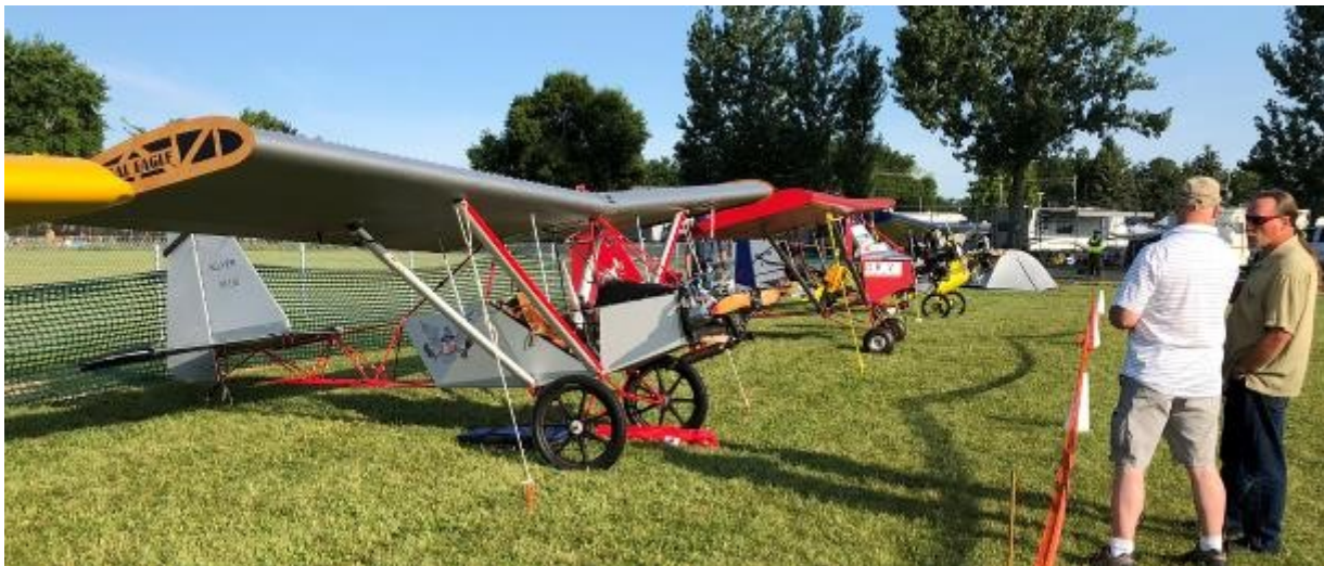
Legal Eagle 20th Anniversary

https://www.youtube.com/watch?v=y6-J7pCRUso&feature=push-u-sub&attr_tag=Crm-cR6y5daKat9j%3A6