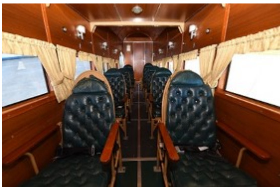
Ride in a 1928 luxury airliner