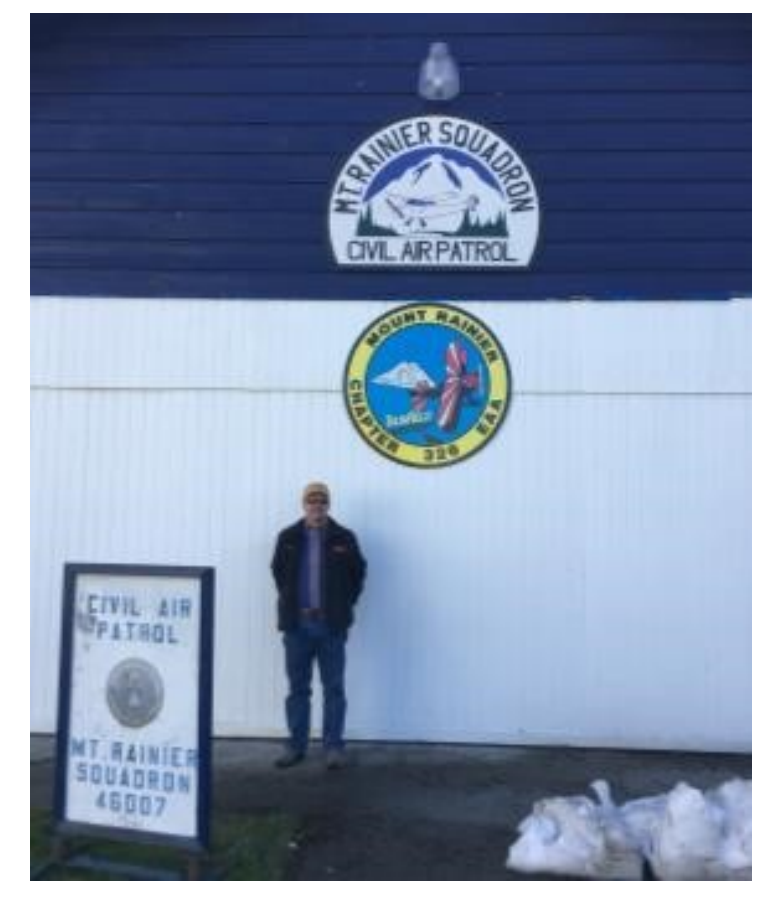
OUR VENUE AT KPLU

Please wear a name tag so that everyone you meet will remember your name! Kindness goes a long way and a personal greeting by you is the best way to make a new friend.