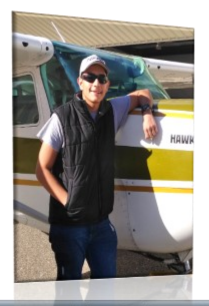
Thank you so much for selecting me to go to the EAA Air Academy to help me be a better pilot.