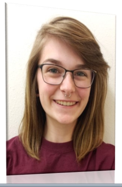
Thank you Chapter 179 for giving me this wonderful scholarship.