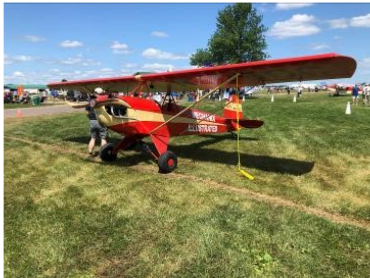
Baby Ace brought out of the museum and back into the air for the Oshkosh 50th Anniversary Celebration

(Chapter 179 Social Gatherings are on the third Tuesday each month.)