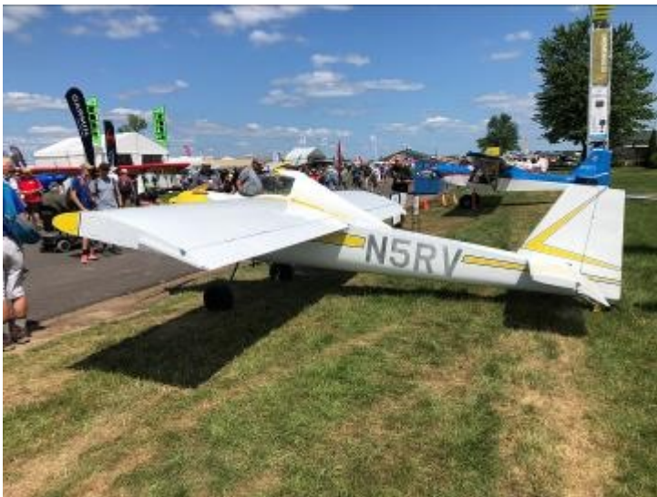
Van's Aircraft, RV-5

AirVenture was bigger and better than ever! The weather was mild and very pleasant for the whole week. Much cooler and dryer than the previous week had been.