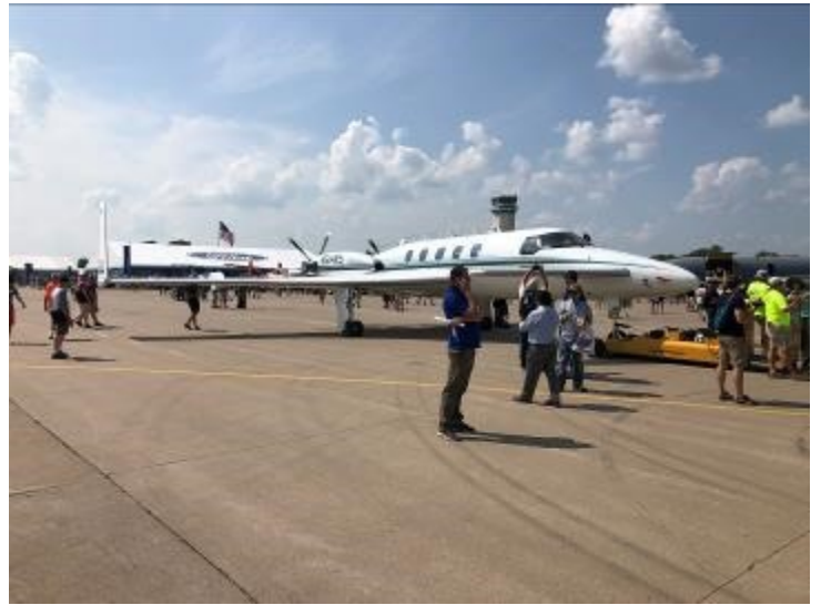
Burt Rutan's designs and lifetime contributions were celebrated. His Beechcraft Starship (above) and other designs were present. I enjoyed two of his talks at the Theater In The Woods.