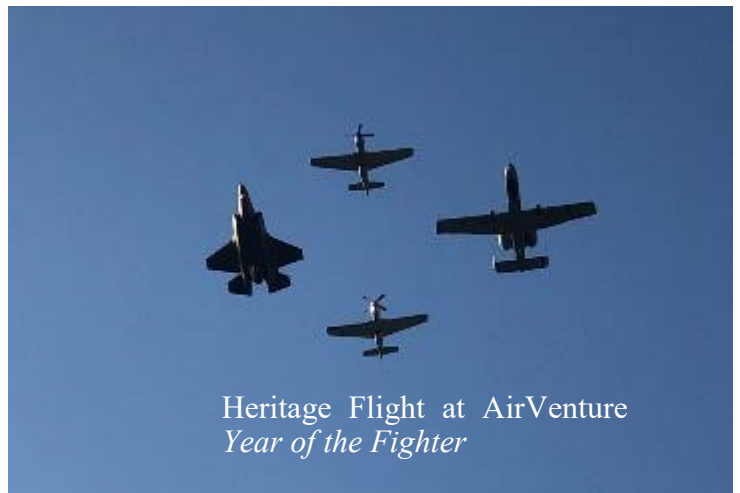
Heritage Flight at AirVenture Year of the Fighter

The auction event is in support of Angel Flight-New Mexico Wing. Check out more on Angel Flight with their website and Facebook links below.