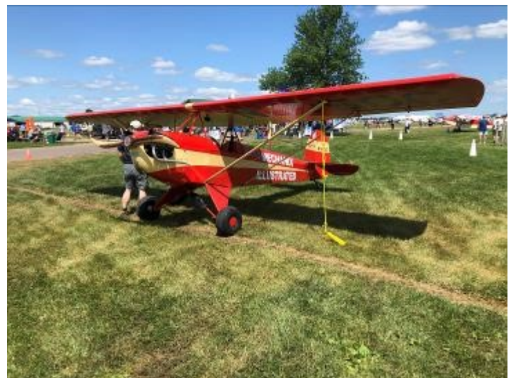
Mechanics Illustrated, Baby Ace that got the EAA movement going. It flew a demonstration flight during the afternoon.