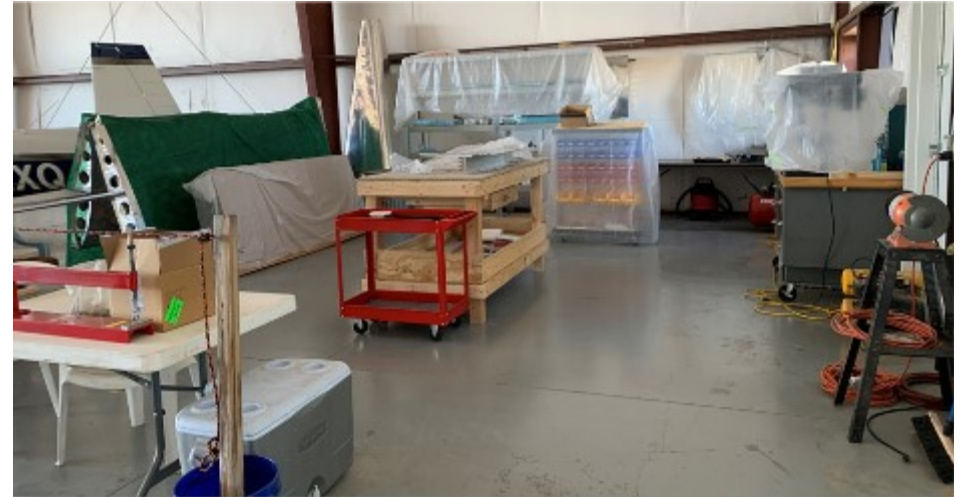
This is our chapter 179 RV-12 work area. Thanks to Bode Aviation for allowing us to use this perfect space in the back of their hangar. It conveniently has a door next to our storage container.

Randy Reimer shows off progress. The chapter workshop is attracting visitors and new members! (plastic keeps parts clean)